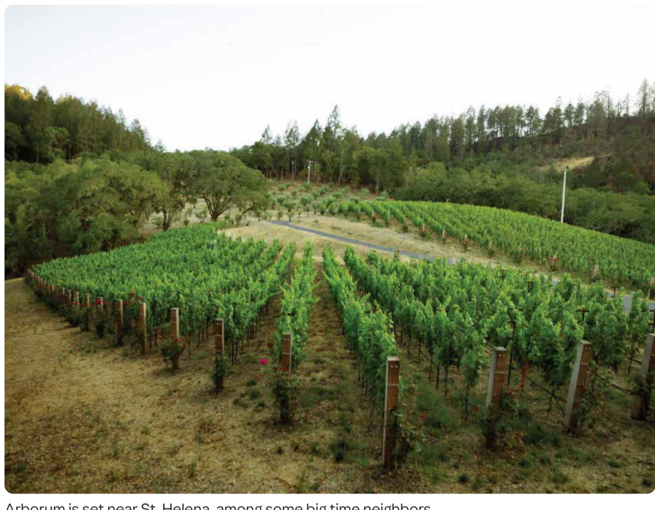
Arborum is set near St. Helena, among some big time neighbors